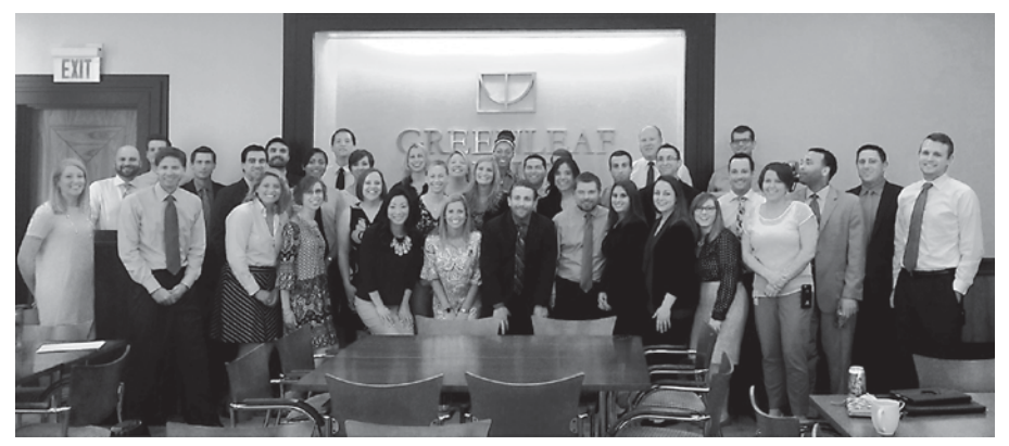
Although Millennials account for only 10% of the national workforce, they make up 45% of Greenleaf Trust's workforce.

"Provided with an environment that supports all generations, we've seen amazing things from these teammates and we look forward to the future impact they will make..."