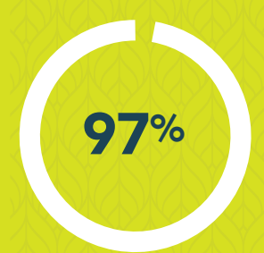
INFORMATION & REPORTING

Greenleaf Trust is committed to continuous improvement, and we strive for 100% client satisfaction across the board.